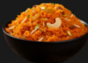
GAJAR HALWA (Seasonal)