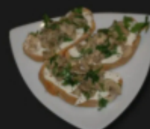
CHEESY MUSHROOM BRUSCHETTA/CHICKEN