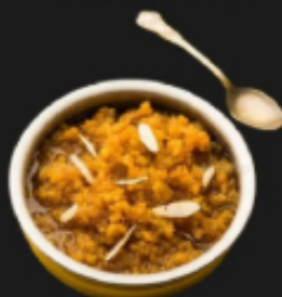
MOONG DAL HALWA