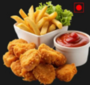
CHICKEN MINCE WITH PEAS+CHEESY Fries[Backed]