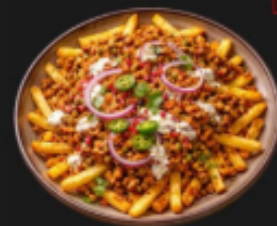
HOT INDIAN LAMB MINCE FRIES (Backed)