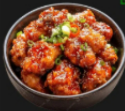
VEG HOT GARLIC DUMPLING/CHICKEN