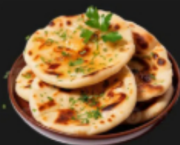
PLAIN NAAN/BUTTER NAAN/ GARLIC NAAN