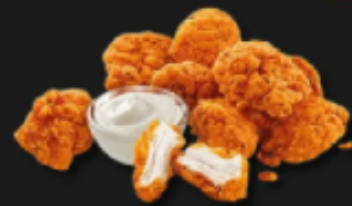
Peri Peri Chicken Popcorn