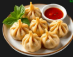
VEG DUMPLING POPS/CHICKEN