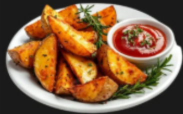
EARTHY POTATO WEDGES