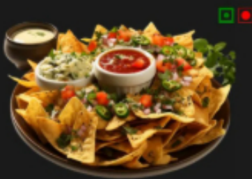
Nachos with Loaded Cheese/CHICKEN