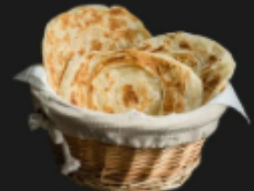
PUDINA LACCHA PARATHA