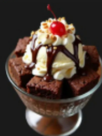
SMOKED WALNUT BROWNIE WITH ICE CREAM