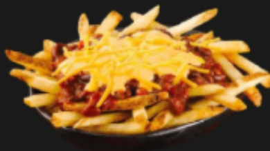
FRENCH FRIES WITH TOPPING CHEESE