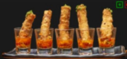
CHEESY PANEER TIKKA/CHICKEN CIGAR ROLL WITH DIP