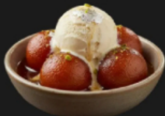
GULAB JAMUN WITH ICE CREAM