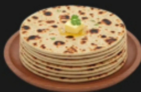
PLAIN TANDOORI ROTI/ BUTTER ROTI