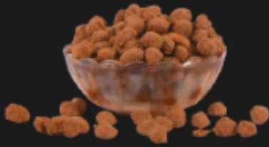
PEANUT MASALA /PLAIN PENUT