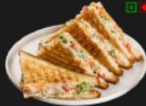
Veg Grill Sandwich/NONVEG